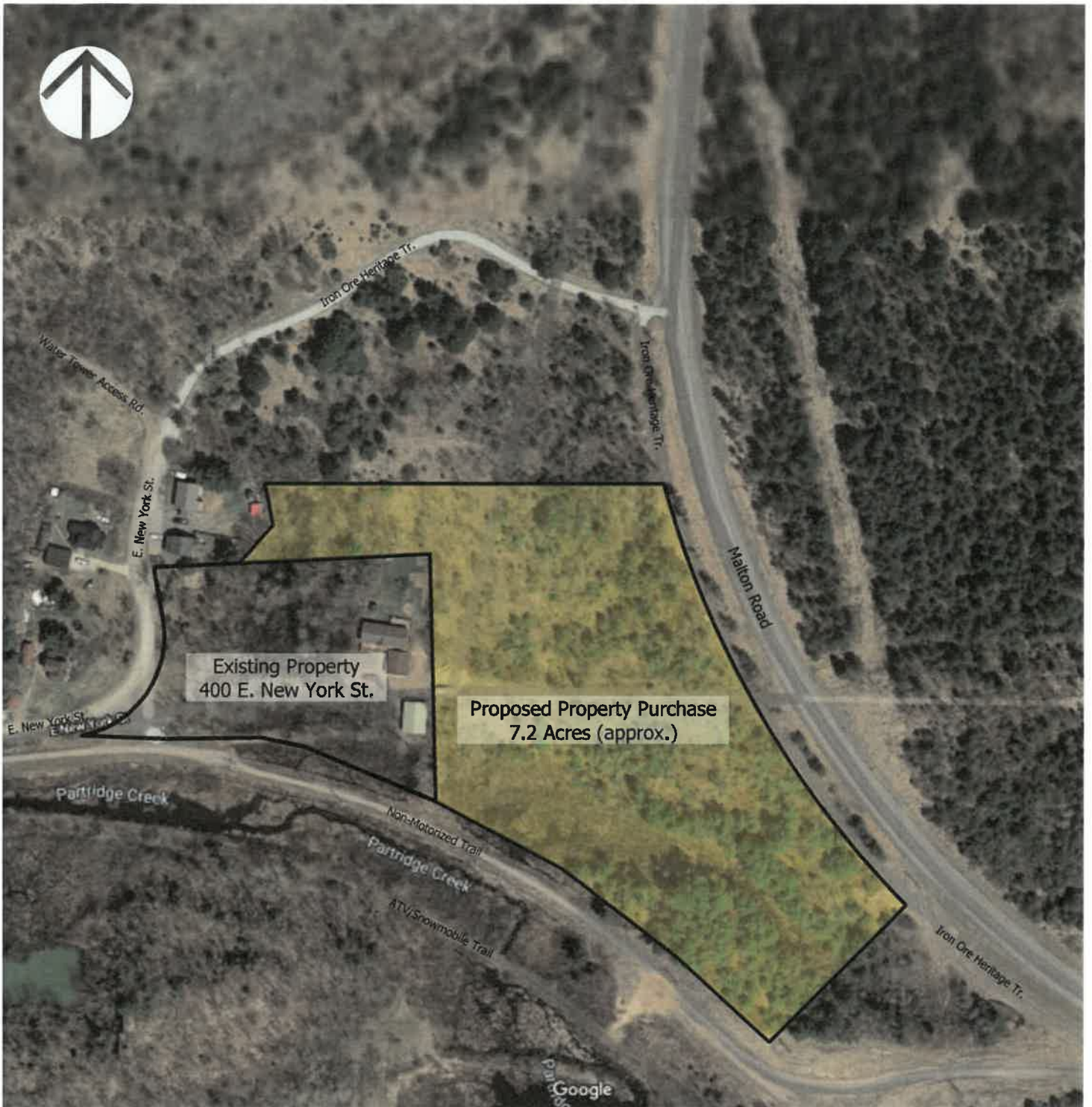
Map of 400 East New York Street and location of adjacent property I am interested in purchasing from the City of Ishpeming.