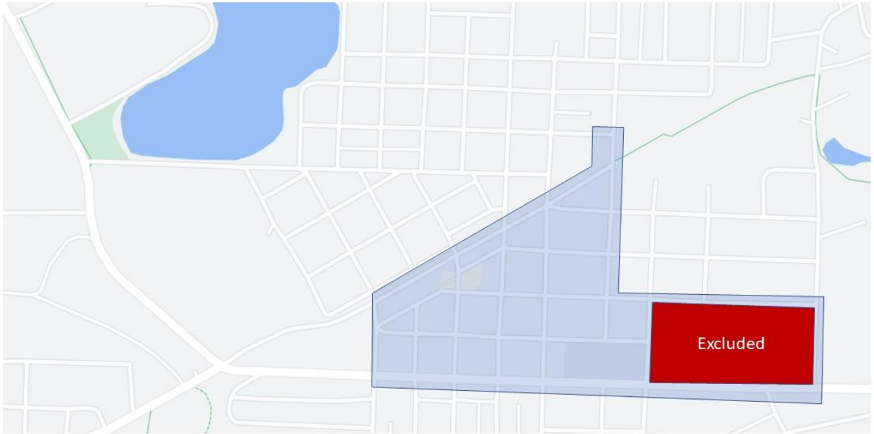
Lake Street to Seventh; Lake Street to Third; South-side of Division to North-side of Hematite; Hematite to E. Ely (along Third St)