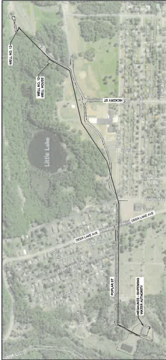
SITE LOCATION MAP (NOT TO SCALE)

PREPARED FOR: NEGAUNEE-ISHPEMING WATER AUTHORITY (NIWA) 1800 NORTH ROAD ISHPEMING, MI. 39849 (906)486-8399